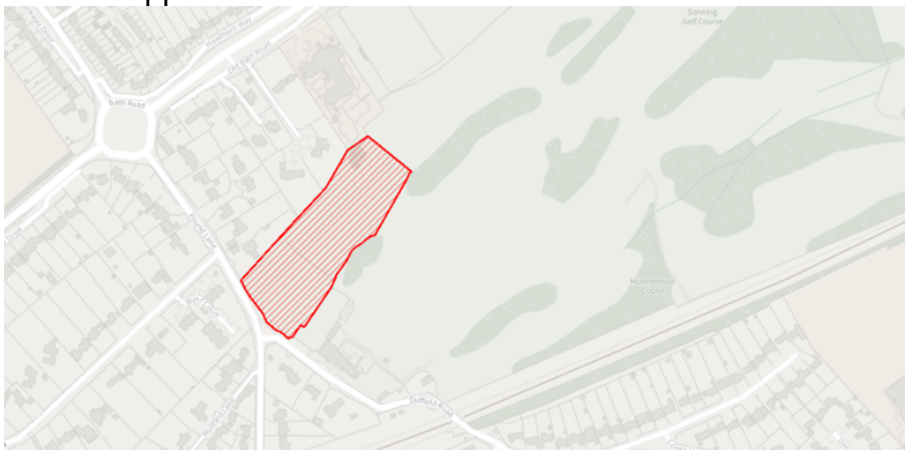
Plan 2 – Sites submitted for LPU that includes 5SO005 and 5SO008